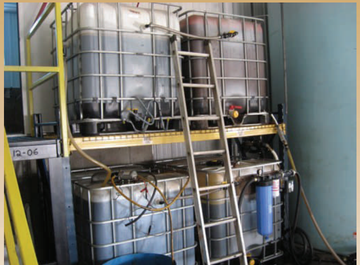
(clockwise from left) The storage bin and flex auger at Indianhead Holsteins. The bin holds canola seeds and one to one and half tons are processed each day./ The storage container area. The containers are located on the opposite side of the wall of the press. / The four 250 gallon bins. The bins store the oil after the seeds are pressed and before they go through the filtration process (see filter bottom right).

Working backwards, one acre of canola produces between 1,700 and 2,000 pounds of canola seeds, which yields roughly 70 - 80 gallons of oil.