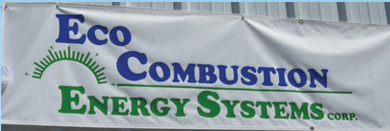
(clockwise from bottom left) EcoCombustion Energy Systems Corporation is now actively marketing its trademarked Elimanure™ technology. / Augers stir the manure as 180 degree air is pumped under the manure. The device takes one hour to travel down the 120 feet long concrete pit. / Steam from the boiler is sent to the turbine. The turbine can produce 600kWh of electricity, enough to power approximately 600 average-sized homes.

manure storage, nutrient management, and water resources. To mitigate these concerns EcoCombustion Energy Systems puts animal waste through a bio-drying and thermal gasification system to create energy.