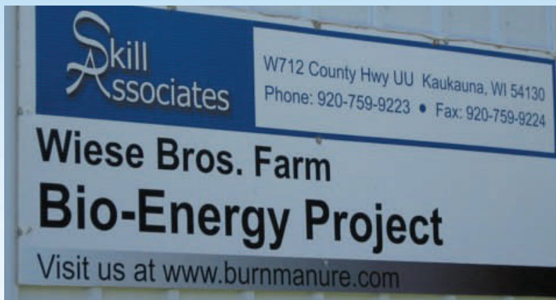
EcoCombustion Energy Solutions, previously Skill Associates, is located on the Wiese Brother's Farm outside Kaukauna, WI.

At the federal level, energy production at the farm occurs within the EPA guidelines which govern CAFOs (Confined Animal Feedlot Operations).